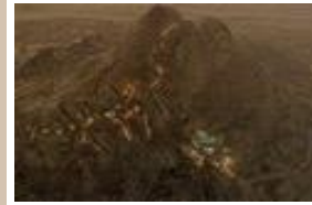
6. SOUTHERN DUNES