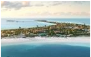
1.2 UMMAHAT ISLANDS